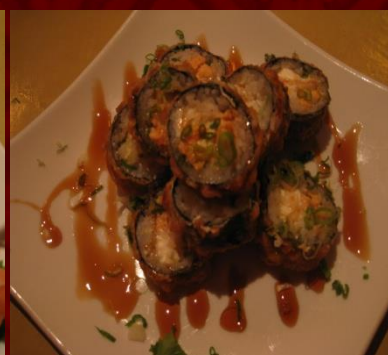
J&B Tempura Roll