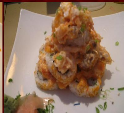
Mount Fuji Roll