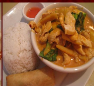
Red Curry w/ Chicken