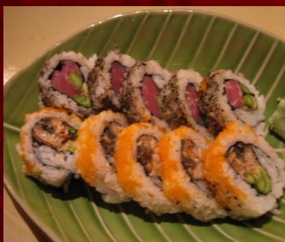
Beauty & The Beast Roll