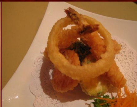
Ebi Tempura Shrimps