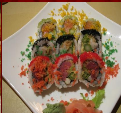
Three flavors Roll