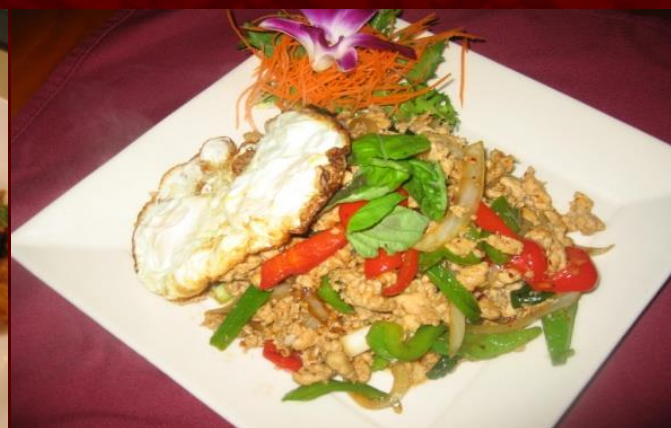
Mother in Law