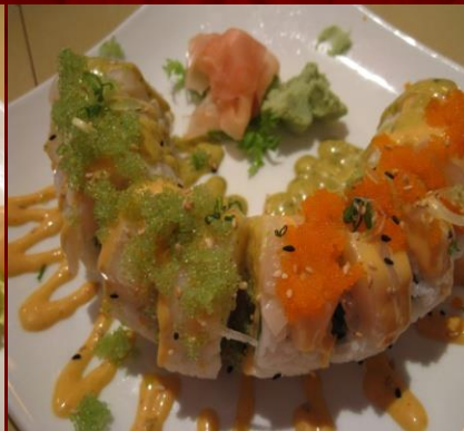
Rock 'n Roll