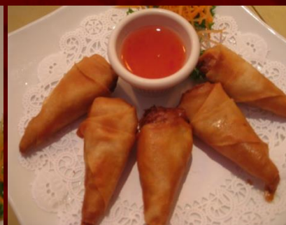
Shrimp in the Blanket