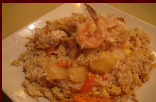
Pineapple Fried Rice