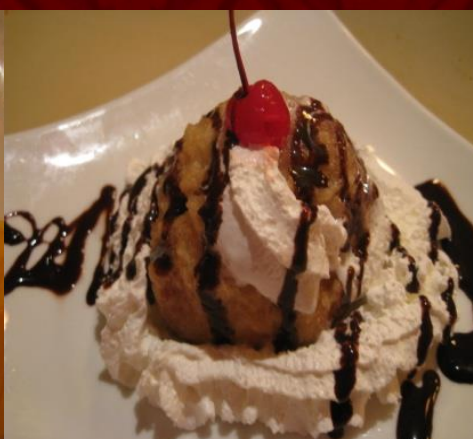
Ice Cream Tempura