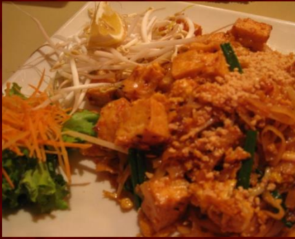
Pad Thai Tofu

(All vegetarian lover dishes contain no egg or fish sauce)