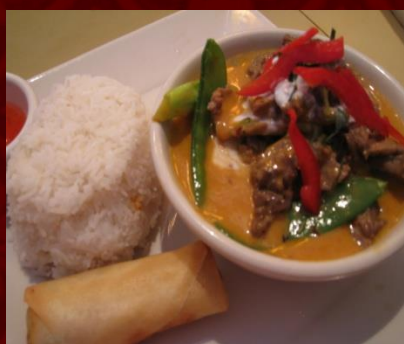
Panang Curry w/Beef