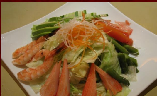
Japanese Garden Salad