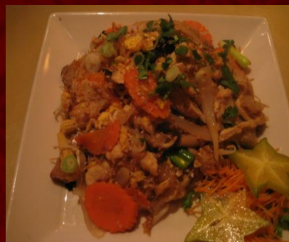
Pad Woon Sen