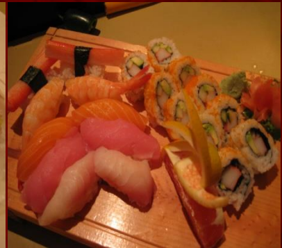
Sushi Mori "A"