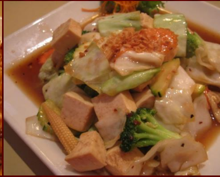
Mixed Vegetables Tofu