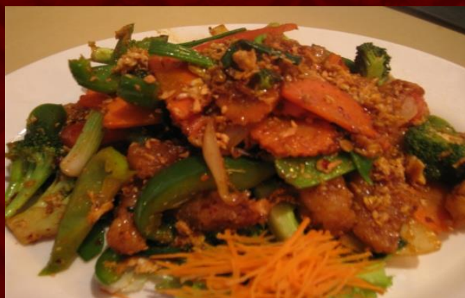
Red Thai Alligator