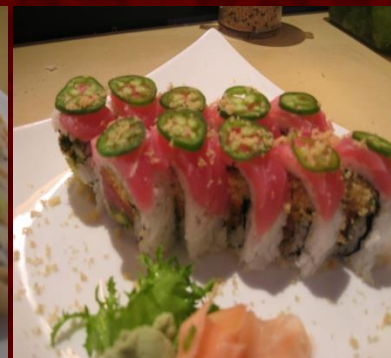
Tuna Jalapeno Roll