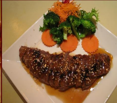
NY Strip Steak Teriyaki