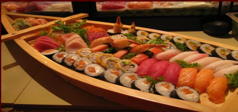
Boat for Three