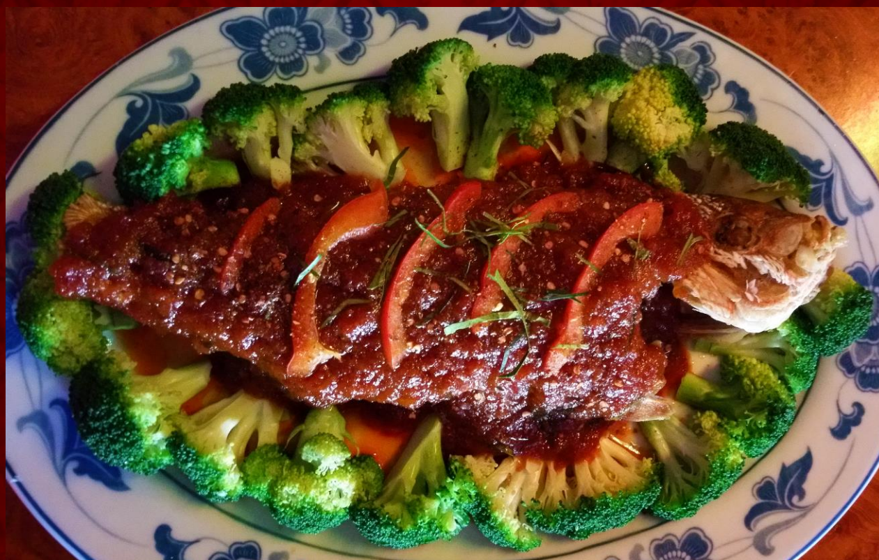
Fried Whole Red Snapper in Volcano Sauce