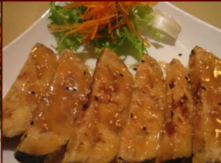
Ebi Tempura Shrimps