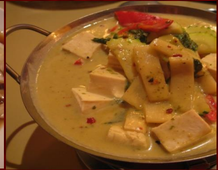
Green Curry Tofu