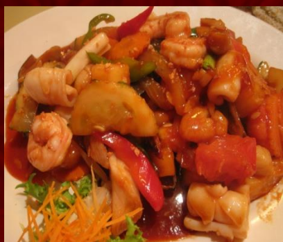
Sweet and Sour

(Served with Jasmine Rice, with choice of Chicken, Beef or Pork - Substitute w/ Shrimp extra $4.00)