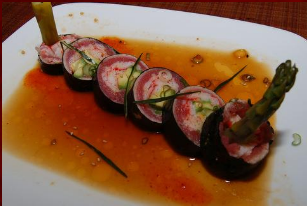
Seared Tuna Roll