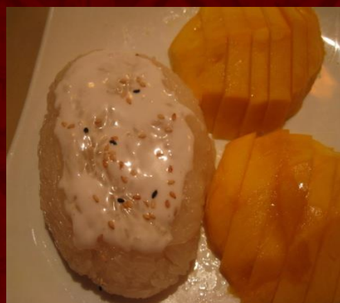
Sticky Rice w/ Mango