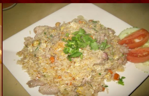
Thai Fried Rice