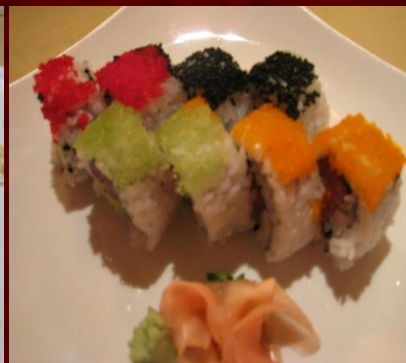
Four Season Roll