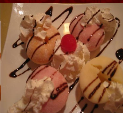
Mochi Ice Cream